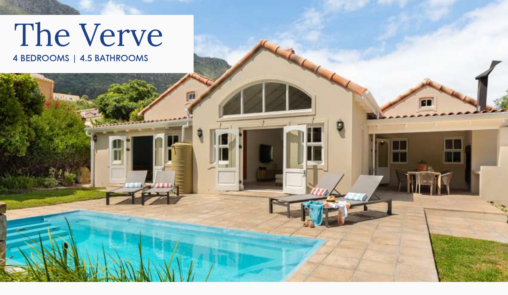
Experience the Epitome of Tranquility

Nestled beside Hout Bay's World of Birds. Enveloped by lush greenery and luxury of a quiet cul de sac, you'll awaken to the harmonious chorus of birdsong. Each room is tastefully adorned in our distinctive luxury boutique decor style, prioritising your comfort and ultimate relaxaà tion. The Verve evokes the spirit of a contemporary farm retreat, offering a modern haven amidst the tranquillity of nature. Plus, you'll benefit from reliable solar power backup during loadshedding periods