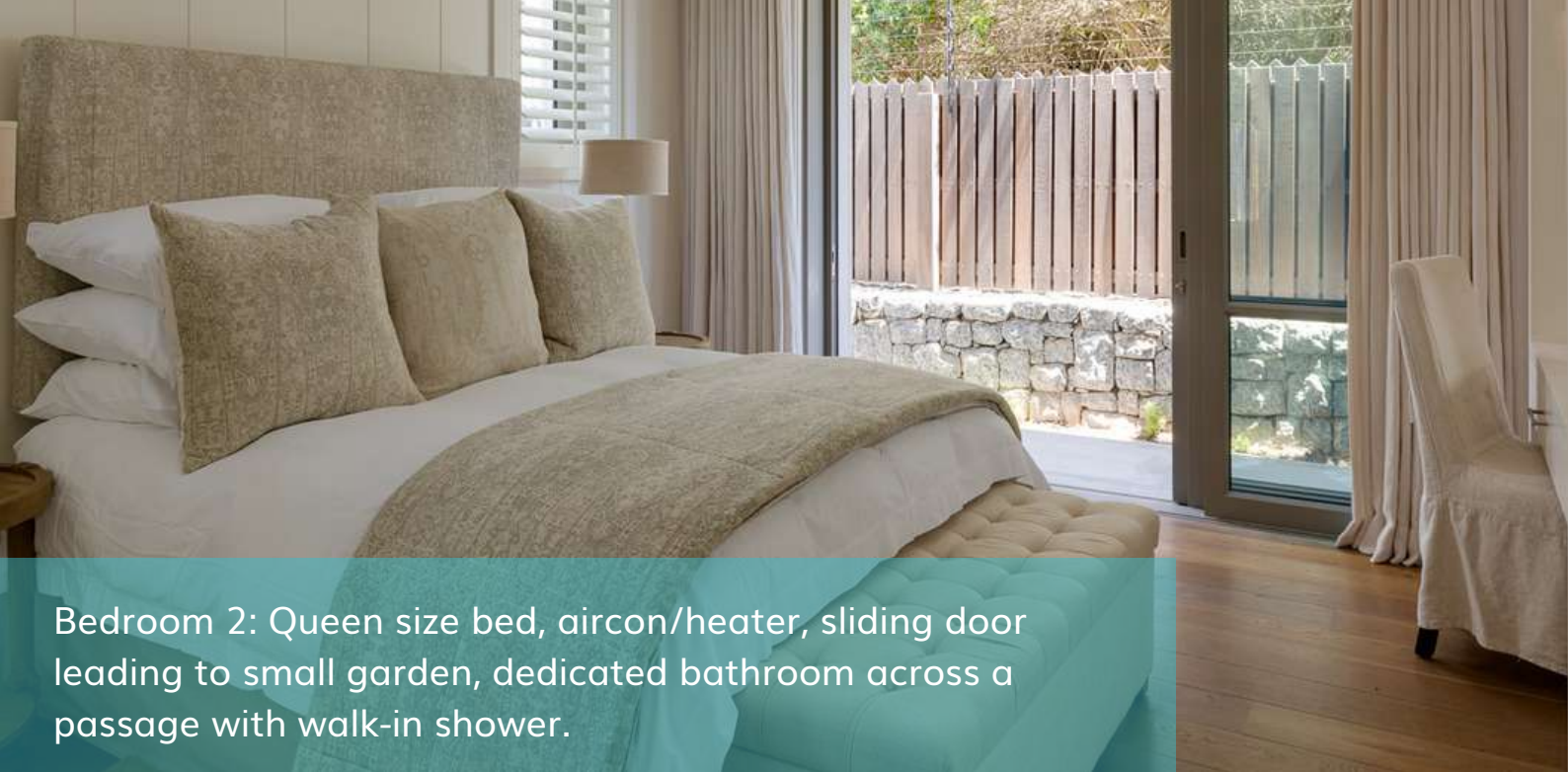
Bedroom 2: Queen size bed, aircon/heater, sliding door leading to small garden, dedicated bathroom across a passage with walk-in shower.