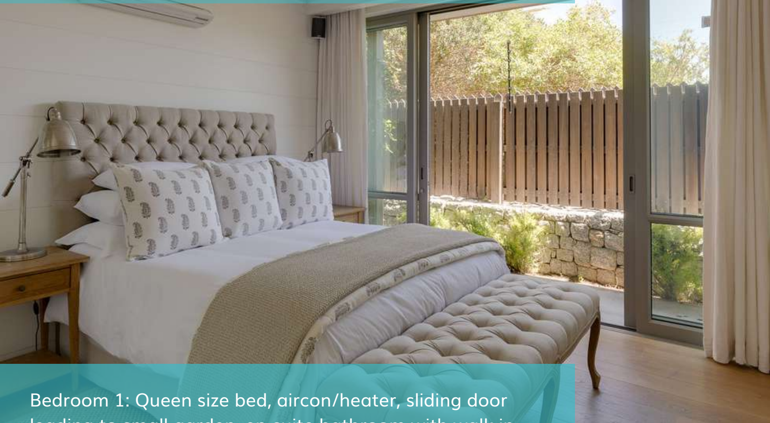
Bedroom 1: Queen size bed, aircon/heater, sliding door leading to small garden, en-suite bathroom with walk in shower.