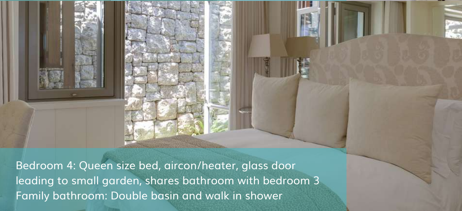
Bedroom 4: Queen size bed, aircon/heater, glass door leading to small garden, shares bathroom with bedroom 3 Family bathroom: Double basin and walk in shower