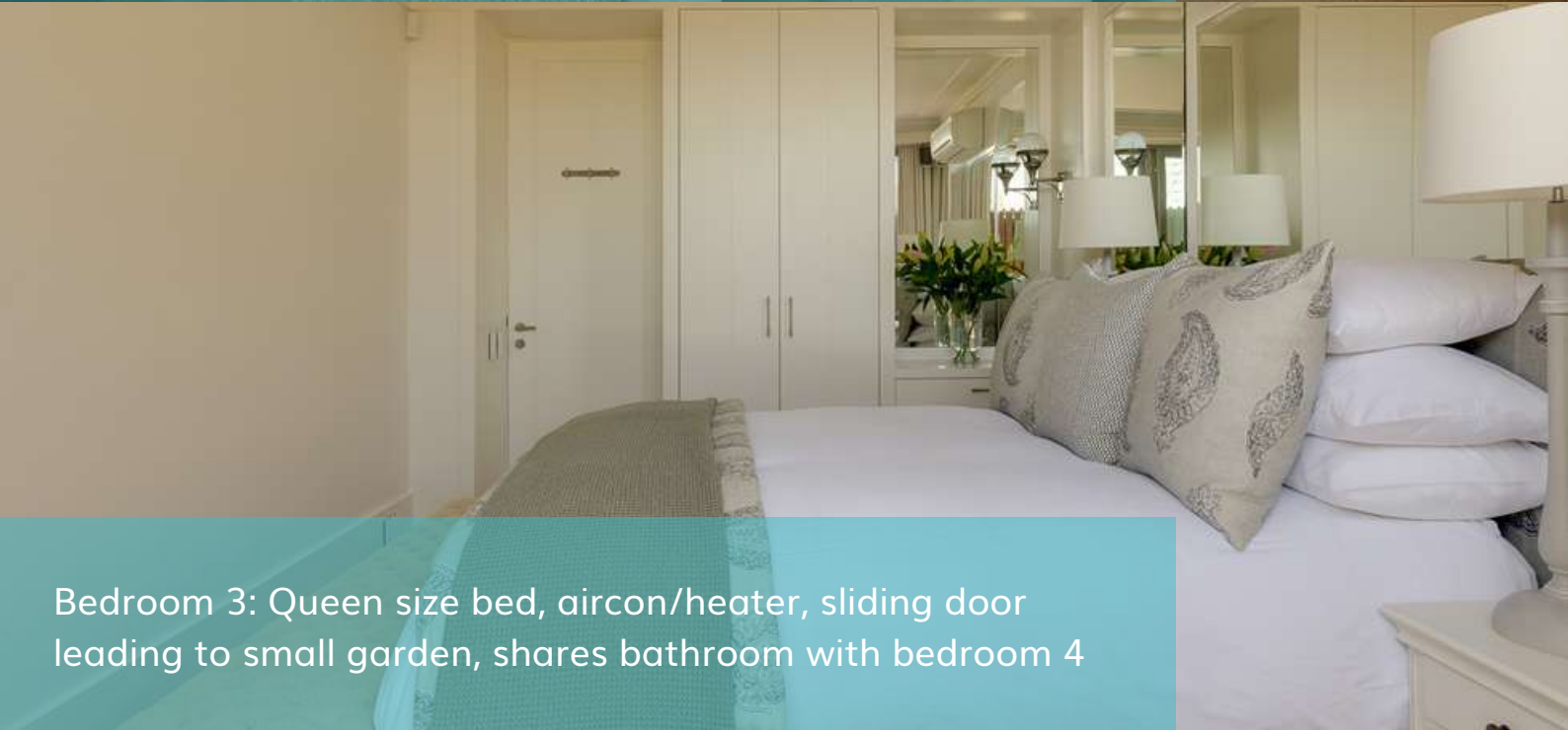
Bedroom 3: Queen size bed, aircon/heater, sliding door leading to small garden, shares bathroom with bedroom 4